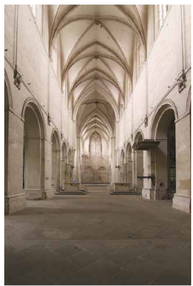
Figure 10: View of the former Cistercian church in Lubiaż, the current state.