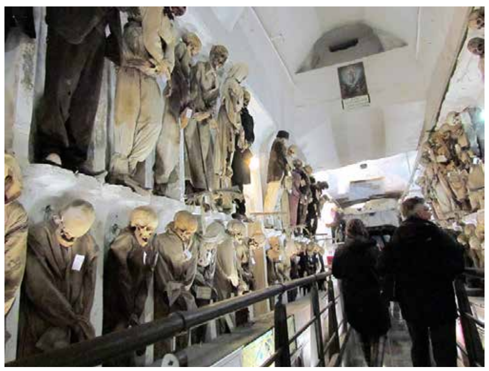
Figure 8: The catacombs at the Capuchin monastery in Palermo.

enlarged and functioned as a burial site until 1880.<sup>17</sup> Similar, although less numerous, groups of mummies can be found in many other places in southern Europe. Suffice to mention that only in Italy have the mummified bodies of as many as 19 Christian saints been preserved, and some of them, such as the mortal remains of Saint Virginia Centurione Bracelli, who died in 1651, are still in excellent condition and have been placed in a special display case currently exhibited in the Cathedral Church of Genoa.<sup>18</sup>