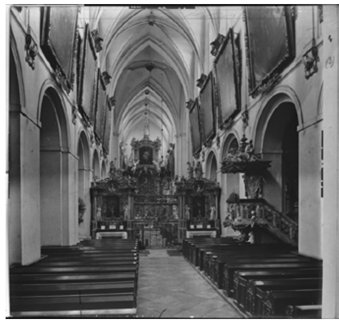
Figure 11: View of the former Cistercian church in Lubiąż, before 1943.

would be recreated using modern multimedia tools.