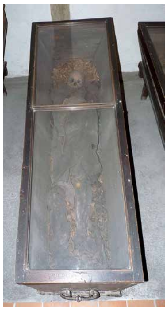
Figure 9: Glazed coffin with the mummified body of the architect Moritz Grimm, located in the crypt of the Capuchin church in Brno.