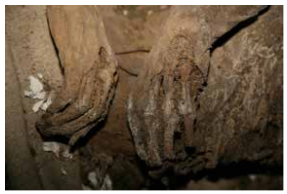
Figure 5: The mummified body of Michael Willmann – hands, the current condition.

tion of the crypt after 1945 it (Figure 3). In its lower part, from the waist down, the mummified soft tissues and clothing were irretrievably destroyed, and only a bare skeleton without tarsal bones remained. However, the upper part of the body, including the chest, head and hands, were fortunately preserved in their mummified state, in a comparable condition to that of the pre-war period. Minor damage to the mummified tissue and clothing had occurred only in the upper part of the skull and on the finger bones (Figs 4 and