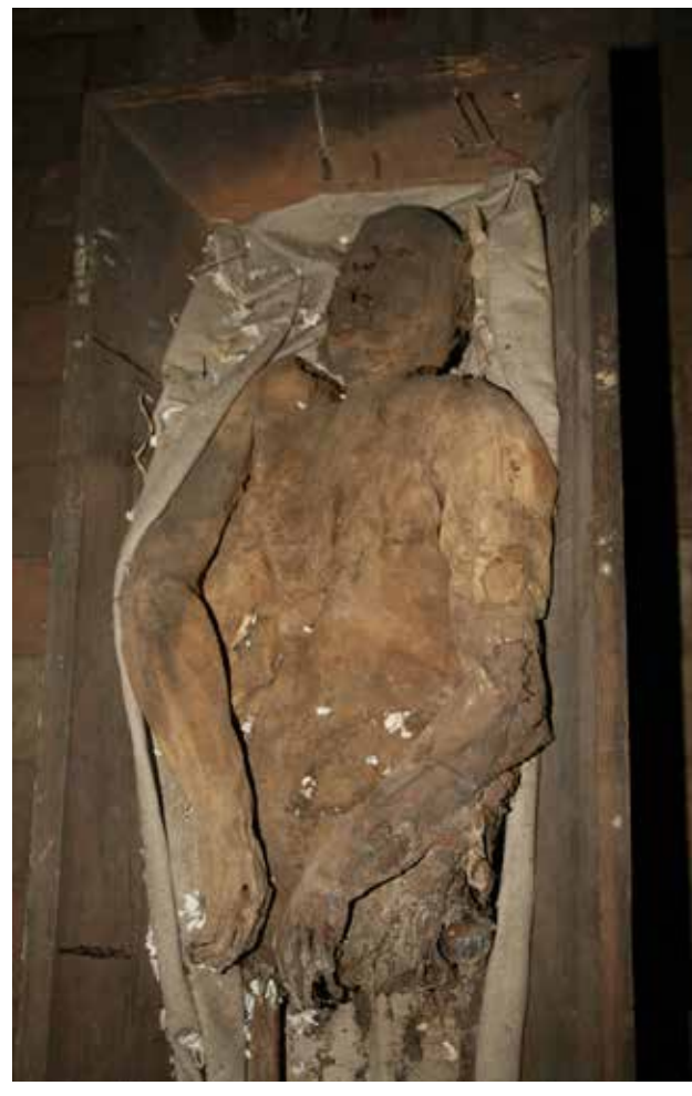
Figure 3: The mummified body of Michael Willmann: current condition.

Unfortunately, the Second World War and the first post-war years were not kind to Willmann's mummy. The decision taken by the German authorities at the end of August 1944 to use the crypt as a storage area for works of art was of key importance to its fate.<sup>7</sup> By hiding the artworks in a religious crypt, the Germans hoped to protect them against potential destruction or theft by Red Army, which was approaching from the east. However, this ruse did not protect them from theft. After Lubiąż was occupied by the Red Army on 25 January 1945, the crypt was plundered many times and its contents were removed. What is worse, during these