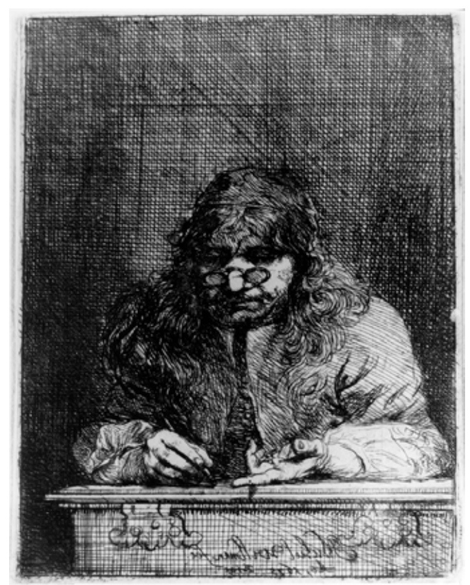
Figure 7: Self portrait of Michael Willmann, made in 1675, etched, printed on paper. The print belongs to Muzeum Narodowe in Warsaw.

the two rows of coffins with the bodies of monks creates a narrow passageway that leads to the western part of the crypt, where the coffin with Willmann's mummy is located. It is separated from the other coffins and positioned along the crypt at its western wall, on which a wooden cross was placed.