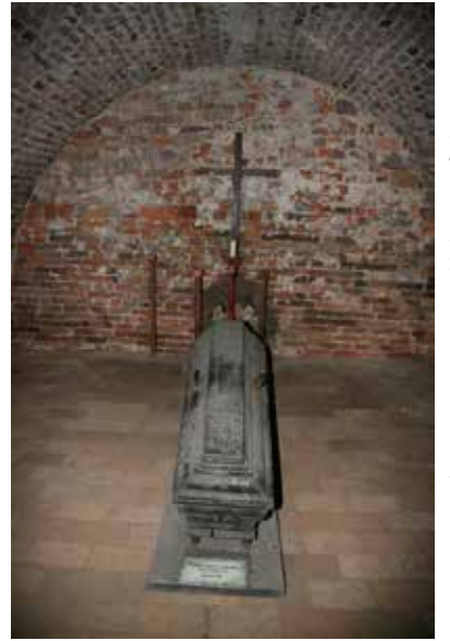
Figure 6: The coffin with the mummified body of Michael Willmann, current condition.