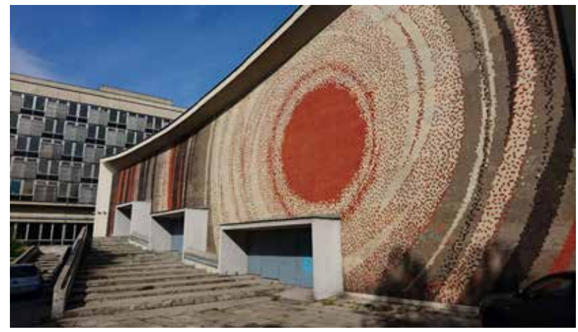
Fig. 2: Rear façade of Kijów by Witold Ceckiewicz after restoration. 2016.

designed by the architect himself in 1967 with typical factory-produced ceramic tiles, and in 2014 was also renovated and covered with impregnate.<sup>22</sup> A spectacular iconographic, mosaic image of a circular red sun on the elevation was contrasted with the white geometric solids of the architecture (Fig. 2).