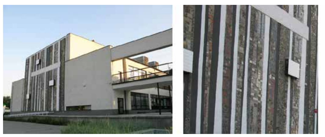
Fig. 3: Radomsko – City Cultural Centre after the restoration of applied art forms. General view and detail of mosaic with new illumination which highlights the vertical composition of the mosaic. 2016. Fot. Author