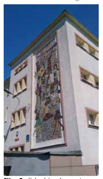
Fig. 5: School façade mosaic by Stanisław Łyszczarz in Częstochowa after modernisation works. 2016.

A rising level of social awareness allows the preservation of applied art forms in cases where the architecture is not unique, so does not have to be protected, but needs restoration and adaption to modern requirements, such as to contemporary thermal specifications. For example, in the Czestochowa school building (Szkoła Podstawowa nr 21, Sabinowska 7/9 St.) of the 1930s, a thermo-isolation system was planned and a part bearing a mosaic of the local artist Stanislaw Lyszczarz from the 1970s<sup>27</sup> was saved on the façade and "framed" with a new form (Fig. 5); although there were no legal regulations protecting the artwork the value of the mosaic was appreciated by officials and local society alike. A similar action with more modern additions being made to older architecture was performed in Tarnowskie Góry city. During the recent renovation of Tarnowskie Góry Cultural Centre, the main façade was largely rebuilt; however, this was carried out with the exposition of a mosaic by Stefan Suberlak from 1973,<sup>28</sup> which in its new architectural frame was highlighted and illuminated (a mosaic by Jan Nowak in the interior also being renovated and exhibited).