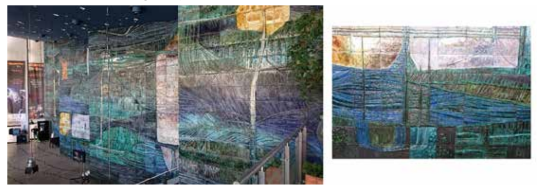
Fig. 1: Interior mosaic by Krystyna Zgud-Strachocka in Kijów Cinema in Cracow after restoration. General view and detail. 2016.

describes the means of protection of contemporary heritage. In case of old town districts, applied art on architectural facades could be protected by the inscription into the register of monuments as part of an urban layout or as an individual monument. In both cases any action is supervised by the local monument conservation office. (Some urban structures are also inscribed on the list of National Monuments, or in case of Warsaw represented on the UNESCO World Heritage List).