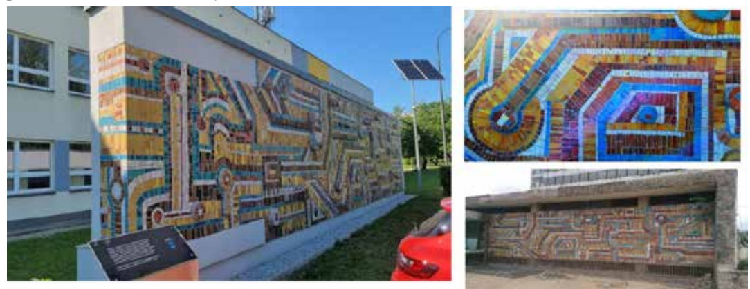
Fig. 8: Tychy. General view before transfer (lower right) and restoration works in 2016 and current exposition of artwork by Franciszek Wyleżuch in 2021 with renovated detail.

In Warsaw, one of the applied art forms from the former factory of lifts, which in fact was an almost beautiful abstract sculpture with mosaic decoration, created by Wanda Gosławska in 1968,<sup>39</sup> became an artistic pavilion in the inner courtyard of a new housing estate. Previously located in the hall entrance of a modernist structure it was important for its colourful accent. Gosławska used tiles of different shades of orange, blue, red, green and black on the heavy sculpture's surface. The artwork was not inscribed into the register of monuments; however, thanks to local society's action the private investor who built the new housing estate removed it from the walls of the demolished factory, conservated it and added a roof which turned it into a garden pavilion and also protects the artwork. Unfortunately, in its new form as a garden pavilion it is accessible only to the residents.