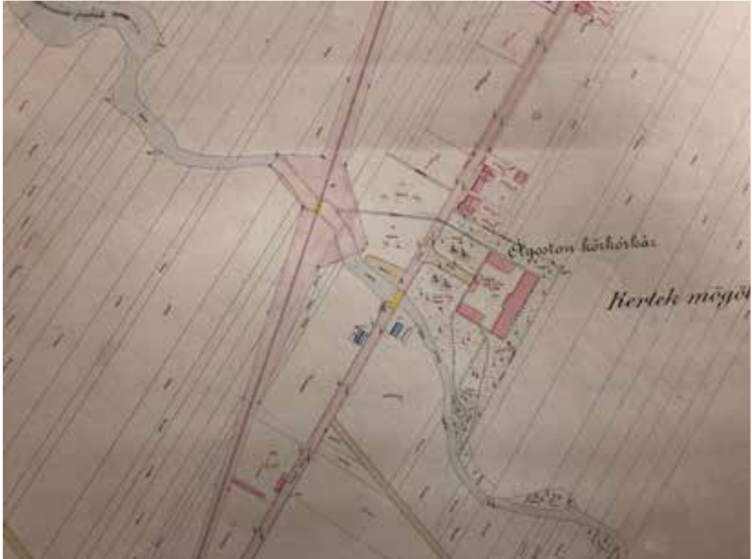
Fig. 1: A drawing of the hospital site on the Topoľčany cadastral map from 1895 (GKÚ Archive)

2. While a private individual and his family founded and initially donated to the hospital, it was gifted to the county of Nitra upon being built, and so it acquired a public character. The hospital's funding and operation were a matter of official supervision. It acquired the status of a county hospital, which was significant for the town of Topoľčany and the surrounding region.