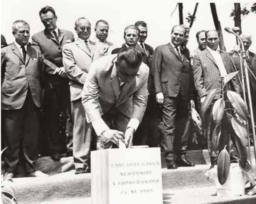
Fig. 5: Laying the foundation stone of the new facility of the hospital in 1969 (Tribeč Museum in Topolčany)