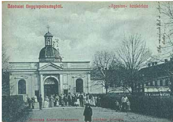
Fig. 2: The hospital chapel and buildings in a 1913 postcard. In the foreground it is possible to see a part of the park between the street and the entrance to the site (Postcard – segment – Tribeč Museum in Topolčany).

fathoms (around 5,250 m 2 ). 6 All four structures were registered under number 282, and the owner was given as the county of Nitra.