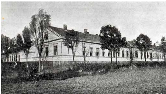
Fig. 3: The hospital buildings before 1918 (Tribeč Museum in Topoľčany)

thus confirming the noble title of baron. Stummer would later provide financial support to the hospital for the maintenance of its buildings, which were prone to damp. 11