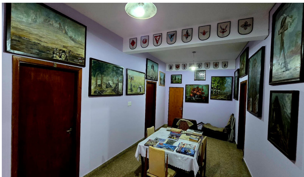
Photo 9: The first room of the museum.

ship, donated to the museum by veterans of the Malvinas War from the town of Concordia, is another valuable exhibit. These memorabilia not only serve as a testament to bravery and sacrifice, they also hold great historical significance, uniting different generations and peoples in the remembrance of shared struggles.