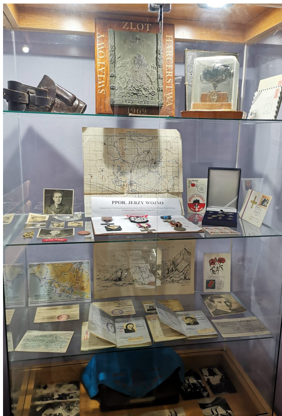
Photo 6: Memorabilia from Second Lieutenant Jerzy Wojno.