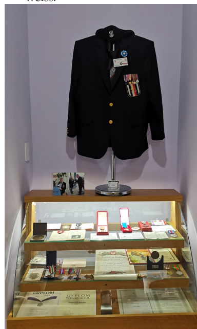
Photo 4: Memorabilia from Lieutenant Franciszek Ślusarz.