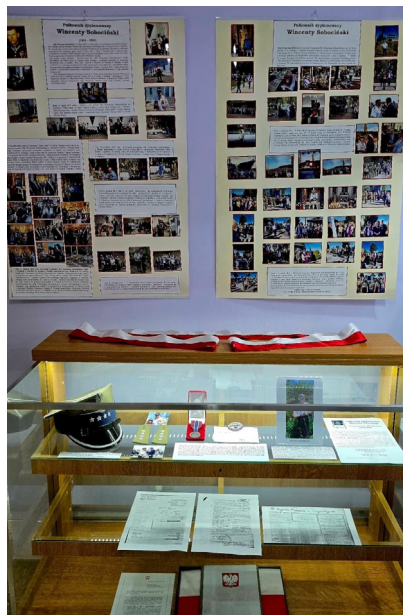
Photo 14: Museum Memorabilia of Wincent Sobociński.