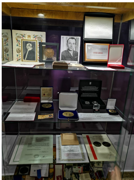
Photo 3: Memorabilia from Colonel Władysław Dąbrowski.