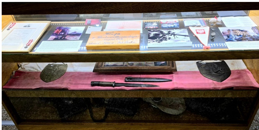
Photo 8: Red and white flag from the 1944 Warsaw Uprising.

colloquially referred to as “Maciaszkowe” by Polish people living in Argentina, acquired its name in honour of Father Justinian Maciaszek. One of the most valuable exhibits in the museum is the original red and white flag from the 1944 Warsaw Uprising (Photo 8), which belonged to the women’s scout troop of the Zośka Battalion in Martin Coronado. This flag is a symbol of the heroic struggle and serves as a unique memento of the Polish scouting movement abroad.