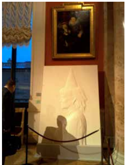
Figure 1: At the exhibition Jan Fabre: the Knight of Despair – the Warrior of Beauty, 21 October 2016 – 9 April 2017, the State Hermitage museum.

and Jan Fabre (Jan Fabre: the Knight of Despair – the Warrior of Beauty, 21 October 2016 – 9 April 2017) in the context of classical art (Figure 1).