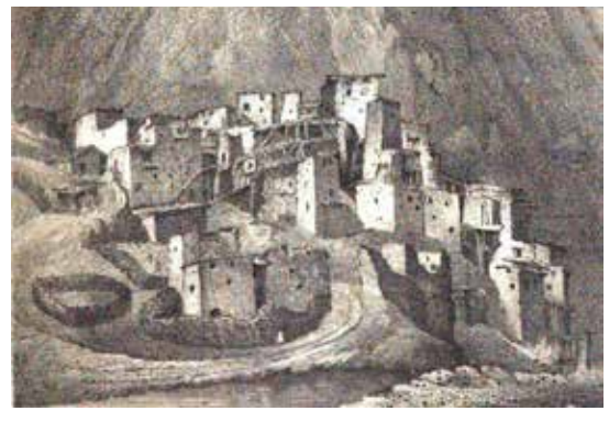
Fig. 8: The village of Shatili

Chainmail armor was typical for Khevsurian and Circassian warriors (Fig. 6 and 7). Along with the chainmail armor, the Khevsurians used small shields, which were not popular among the Circassians. One more difference was that the Khevsurians lived in defensive towers. For example, the Khevsurian village