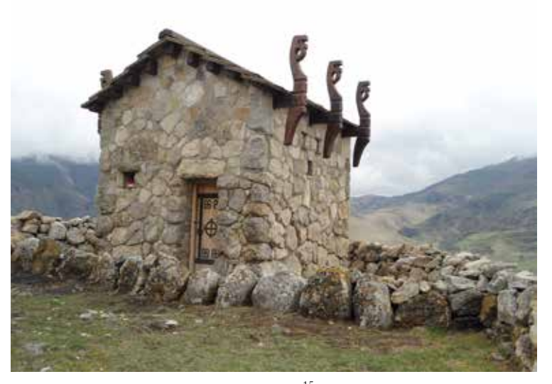
Fig. 3: Khuytsauy dzuar sanctuary (Ossetia)<sup>15</sup>

Let us give one more example of a sanctuary. This time it is in the territory of Ossetia (Fig. 3).