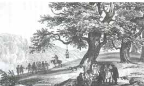
Fig. 4: Circassia: cross worshipping