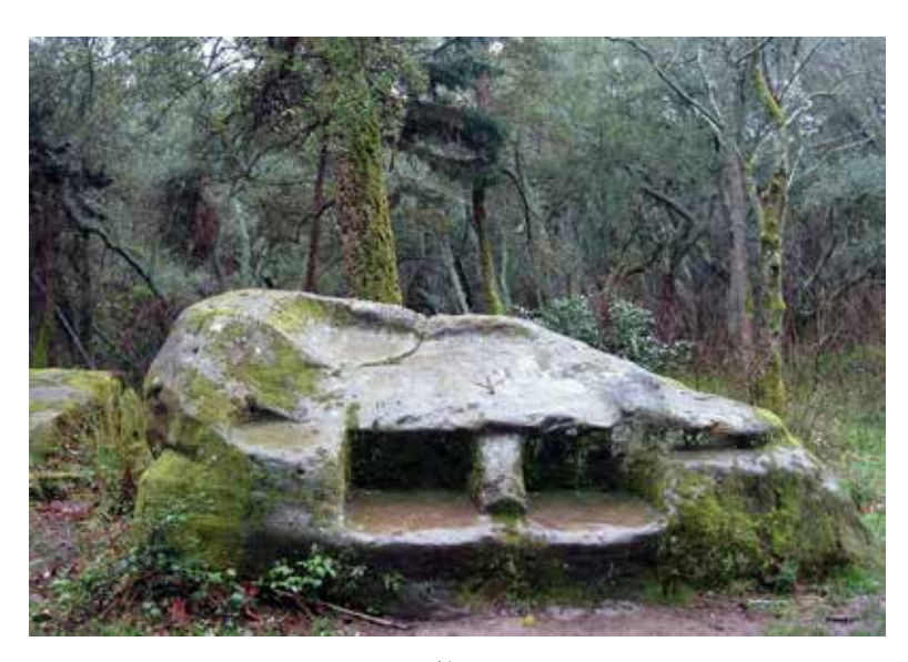
Fig. 2: The sacrificial stone in Kudepsta<sup>14</sup>

Let us give one more example of a sanctuary. This time it is in the territory of Ossetia (Fig. 3).