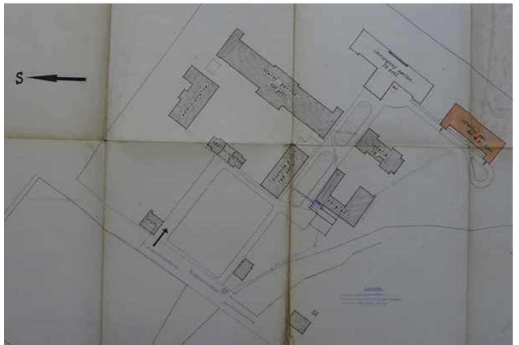
Fig. 4: The extension to the hospital site with the addition of the infectious diseases facility, 1941. Based on these plans, the hospital complex was supposed to include a surgical facility that was intended to close off that part of the site that had been constructed in the interwar period (State Archive in Nitra — Topolčany Office).

was necessary, among other things, to deal with the regulation of the Nitra River and the Chotina River and avoid building anything in their flood plains. Ground water and the flooding of the Chotina River posed a threat to the hospital buildings from the very beginning, and the hospital's administration continually had to deal with problems of damp basements and ground-floor spaces.