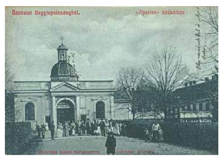
Fig. 2: The hospital chapel and buildings in a 1913 postcard. In the foreground it is possible to see a part of the park between the street and the entrance to the site (Postcard – segment – Tribeč Museum in Topolčany).

fathoms (around 5,250 m<sup>2</sup>).<sup>6</sup> All four structures were registered under number 282, and the owner was given as the county of Nitra.