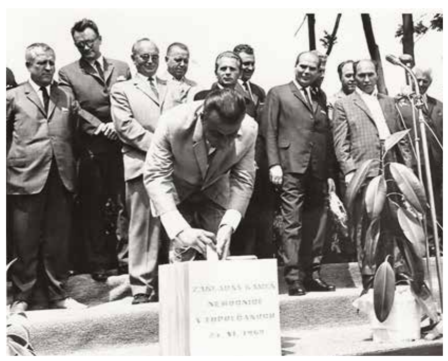
Fig. 5: Laying the foundation stone of the new facility of the hospital in 1969