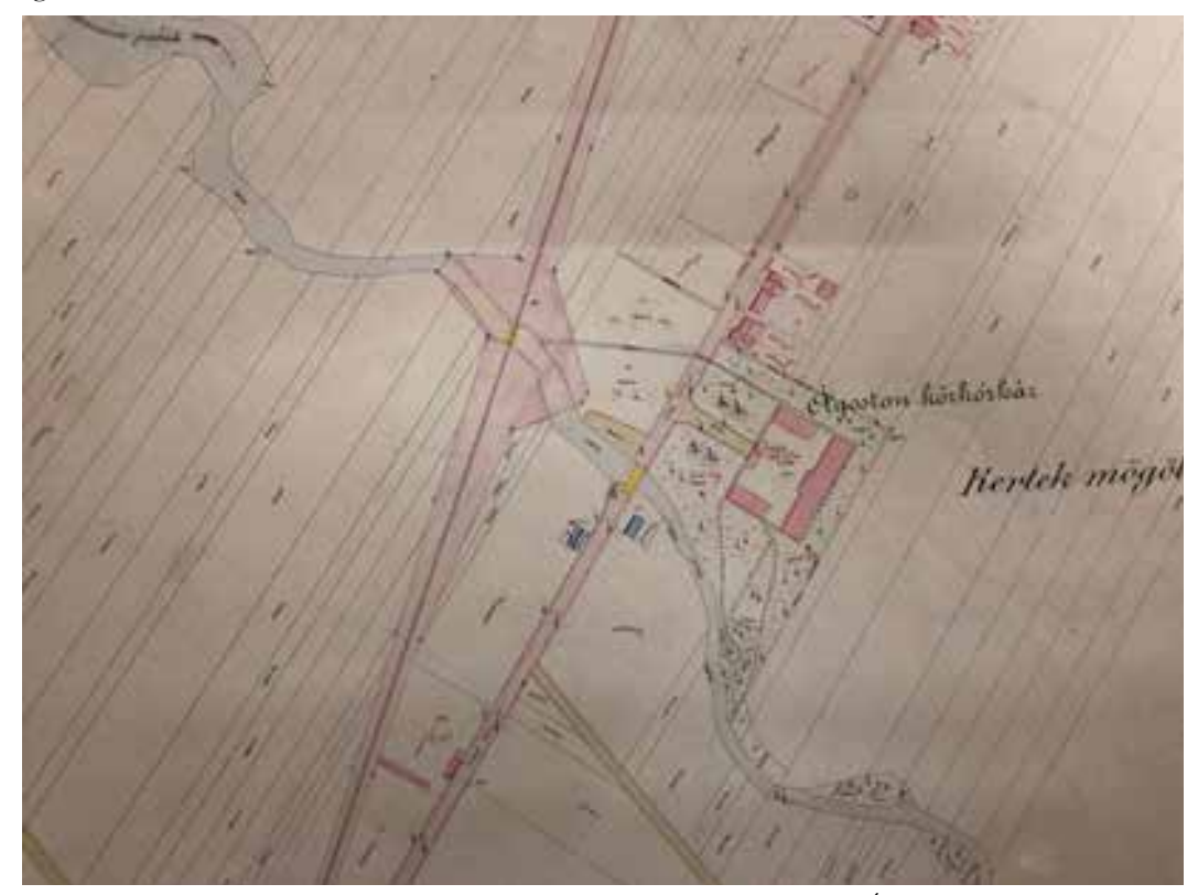
Fig. 1: A drawing of the hospital site on the Topol'čany cadastre map from 1895

2. While a private individual and his family founded and initially donated to the hospital, it was gifted to the county of Nitra upon being built, and so it acquired a public character. The hospital's funding and operation were a matter of official supervision. It acquired the status of a county hospital, which was significant for the town of Topol'čany and the surrounding region.