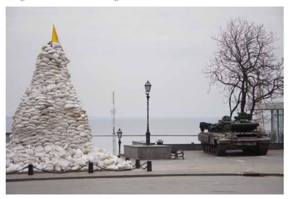
Figure 3: Protection of the Duke de Richelieu Monument on the Odessa embankment with sandbags. March 2022.

Another project supporting Ukraine in preserving its historic cultural heritage is the SUM project, coordinated by 4CH (European Centre of Competence for the Preservation of Cultural Heritage). SUM's activities consist of rescuing digital documentation of Ukrainian cultural heritage. These digital texts, images, drawings and 3D models will be extremely useful for restoring and, if necessary, reconstructing damaged cultural property, and for preserving and transmitting Ukrainian culture and history to future generations. Ukrainian datasets have started to be uploaded via the internet and securely stored on servers. Approximately 100 terabytes are currently in pending or have already been transferred, in a project involving a huge range of organisations, from large urban institutions to relatively small museums outside the main centres. The transfer takes time due to the intense difficulties on the Ukrainian side in collecting the datasets and maintaining an internet connection in conditions of war.<sup>45</sup>