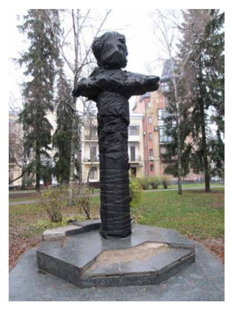
Figure 7: Monument to Pushkin in Poltava. November 2022.