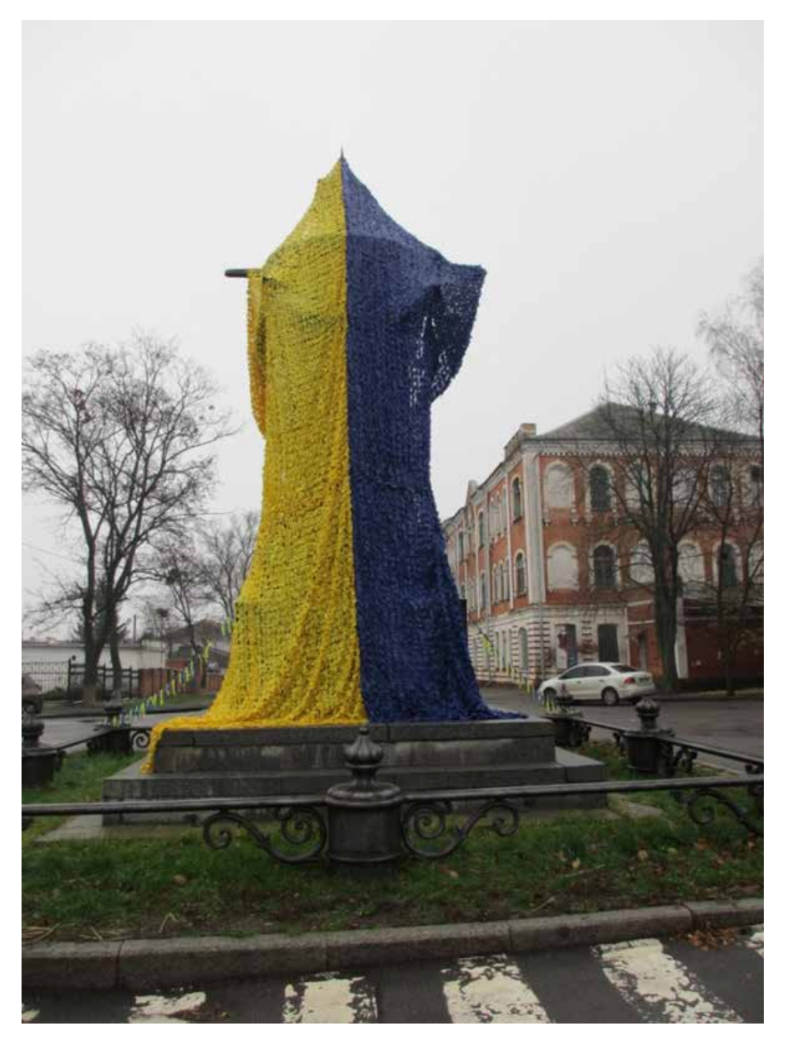
Figure 6: Monument at the resting place of Peter I in Poltava. November 2022.