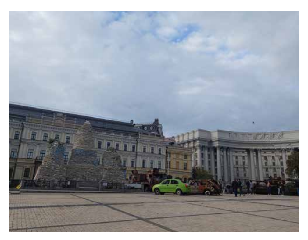
Figure 4: Protection of the monument to St Princess Olga and St Cyril and Methodius with sandbags. October 2022.

A separate issue, and one generating considerable debate, relates to the fate of monuments of the imperial past, namely, the Russian Empire and the Soviet Union. Today, the events of the Russian–Ukrainian war have exacerbated this issue in Ukrainian society, and in many cases such monuments have been spontaneously dismantled and destroyed, painted with patriotic inscriptions and graffiti, or painted in different colours. Public opinion is divided on this issue: some citizens believe that these monuments should be destroyed altogether; others argue that many were created by prominent sculptors and should be transferred to appropriate exhibitions dedicated to totalitarian art; and yet others believe these monuments, which have long been interpreted as works of art, should be preserved in place.