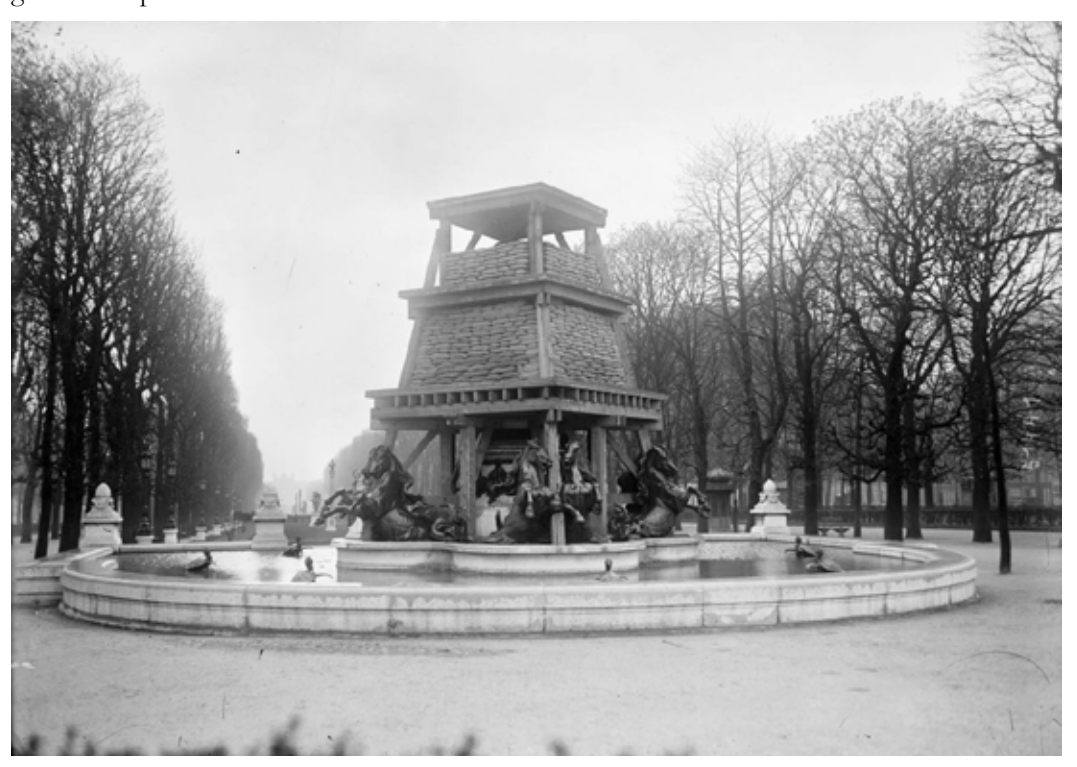
Figure 2: Structure with bags to protect the Quatre-Parties-du-Monde fountain in the Jardin Marco Polo in Paris from German bombing, 1918.

During the Second World War, a simplified approach to protecting monuments with sandbags was used during Nazi attacks on cities in France or Britain (Figure 2). There are photographs and descriptions, for example, of protective scaffolding and sandbags set up around the base of the Luxor Obelisk on the Place de la Concorde in Paris (May 1940) and sandbag-protected garden sculptures in Versailles.