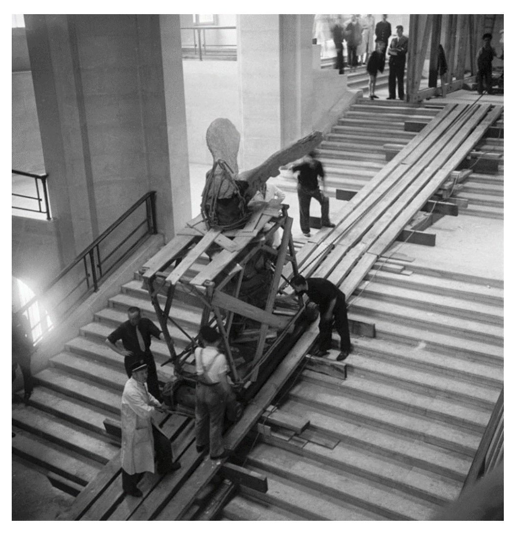
Figure 1: The removal of the protected statue of the Winged Victory of Samothrace from the Louvre from the Grande Gallerie of the Louvre September 1939.

At the heart of the Imperial War Museum's "Culture Under Attack" exhibition was an attempt to answer the question of why some leaders try to erase or exploit culture while others risk everything to protect, celebrate and rebuild it. This is a question that should be asked especially today (this article was written in November–December 2022), as, in the course of the war in Ukraine, the country's precious monuments are being irretrievably destroyed by the Russian aggressors. It seems that the destruction is the result of the criminal actions<sup>36</sup> of Russian President Vladimir Putin, who, displaying all the characteristics of a modern despot, seems to believe that the destruction of a nation's material culture will cause its integrity and militant spirit of resistance to atrophy. These conclusions serve as one of the main justifications for waging war on and occupying Ukraine. Since its illegal occupation of Crimea, and parts of